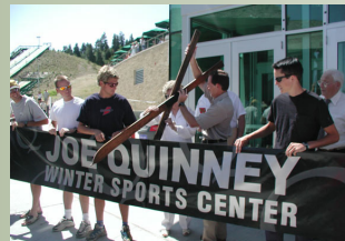
Ribbon Cutting Ceremony, July 2002