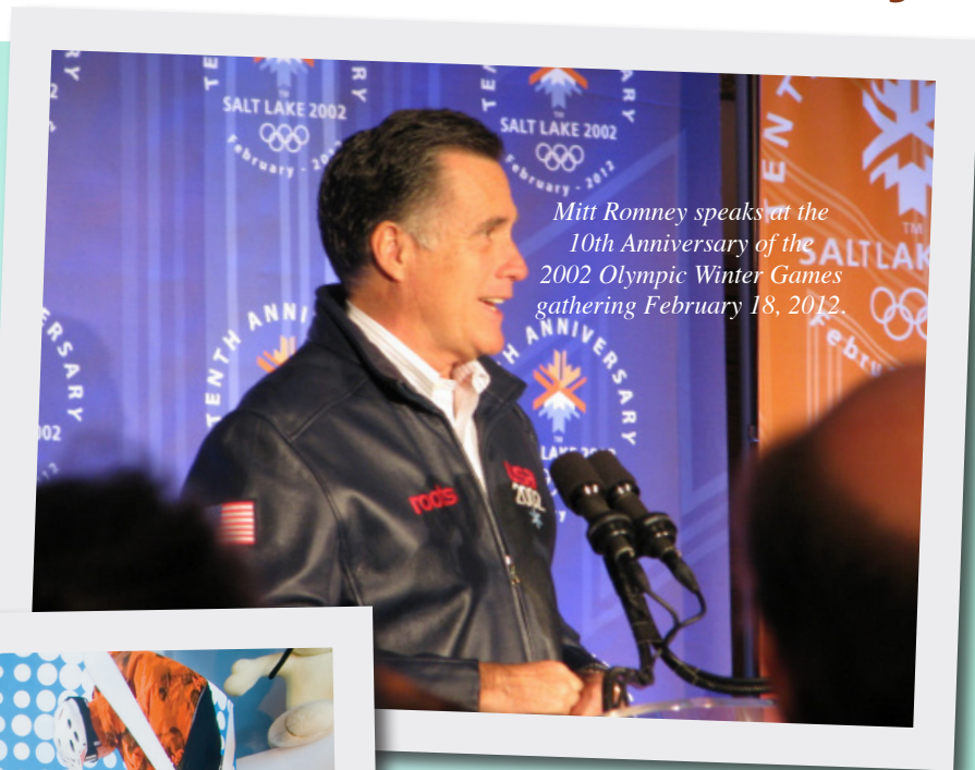
Mitt Romney speaks at the 10th Anniversary of the 2002 Olympic Winter Games gathering February 18, 2012.