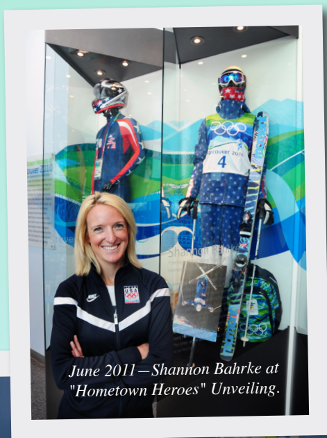
June 2011—Shannon Bahrke at "Hometown Heroes" Unveiling.