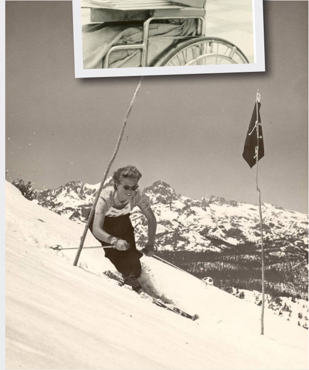
Jill Kinmont racing through the slalom gates at Mammoth Mountain, California.