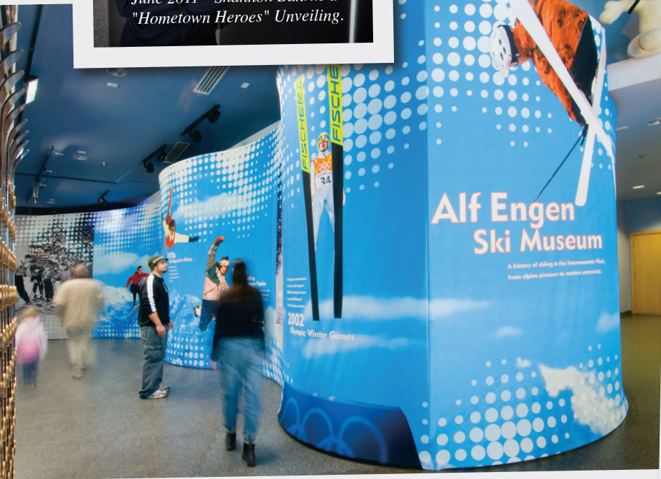
New entry wall at the Alf Engen Museum—November 2007.