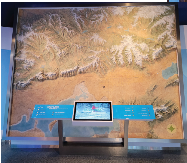
Ski area resorts topographic map

The common reaction to our remodel is "WOW!" Please visit our free museum soon to check out the improvements for yourself. You will not be disappointed!