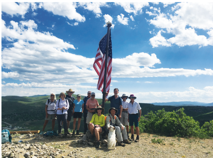
A group of hikers sit atop Ecker Hill June, 2021