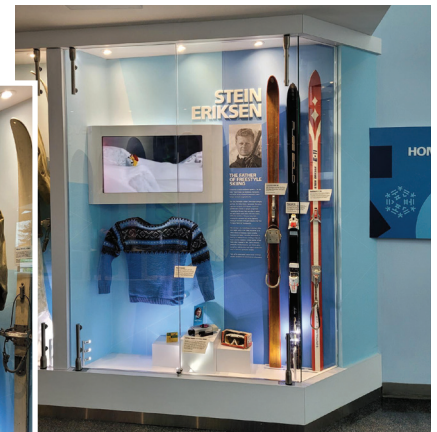
Renovated Stein Eriksen Display