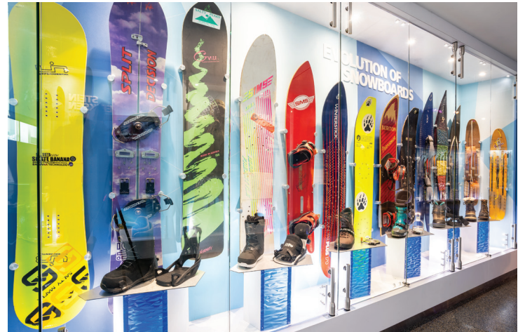
Evolution of Snowboards

Plans were approved and a fundraising campaign commenced with a goal to raise a lofty $1 million by 2020. After a brief 10-week shutdown, we revived our fundraising and our exhibit team, Unrivaled, started the exhibit build early 2021.