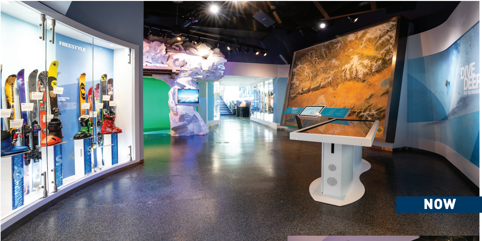
Remodeled area and new exhibits

The Alf Engen Ski Museum opened its doors shortly after the 2002 Olympic Winter Games in May 2002. Over the past 20 years, the museum's Board of Trustees has continued to achieve its goal "To inspire guests by providing a rich assortment of interactive displays which allow visitors to gain insight into the development of winter sports throughout the Intermountain Area." The museum strives toward its vision "To be the recognized world leader in ski history museums." To these ends, an ambitious project started to take form in 2018.