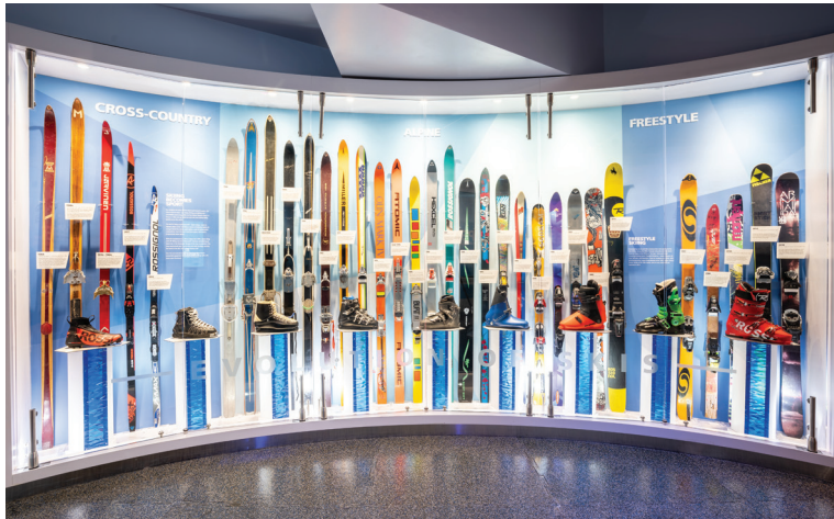
Evolution of Skis