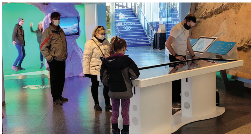
Interactive table opens