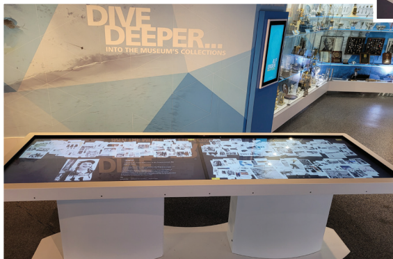
Interactive Touch Table