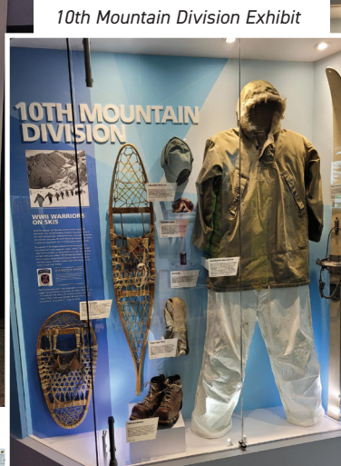
10th Mountain Division Exhibit