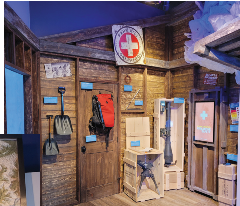
Avalanche exhibit - ski patrol hut

Plans were approved and a fundraising campaign commenced with a goal to raise a lofty $1 million by 2020. After a brief 10-week shutdown, we revived our fundraising and our exhibit team, Unrivaled, started the exhibit build early 2021.