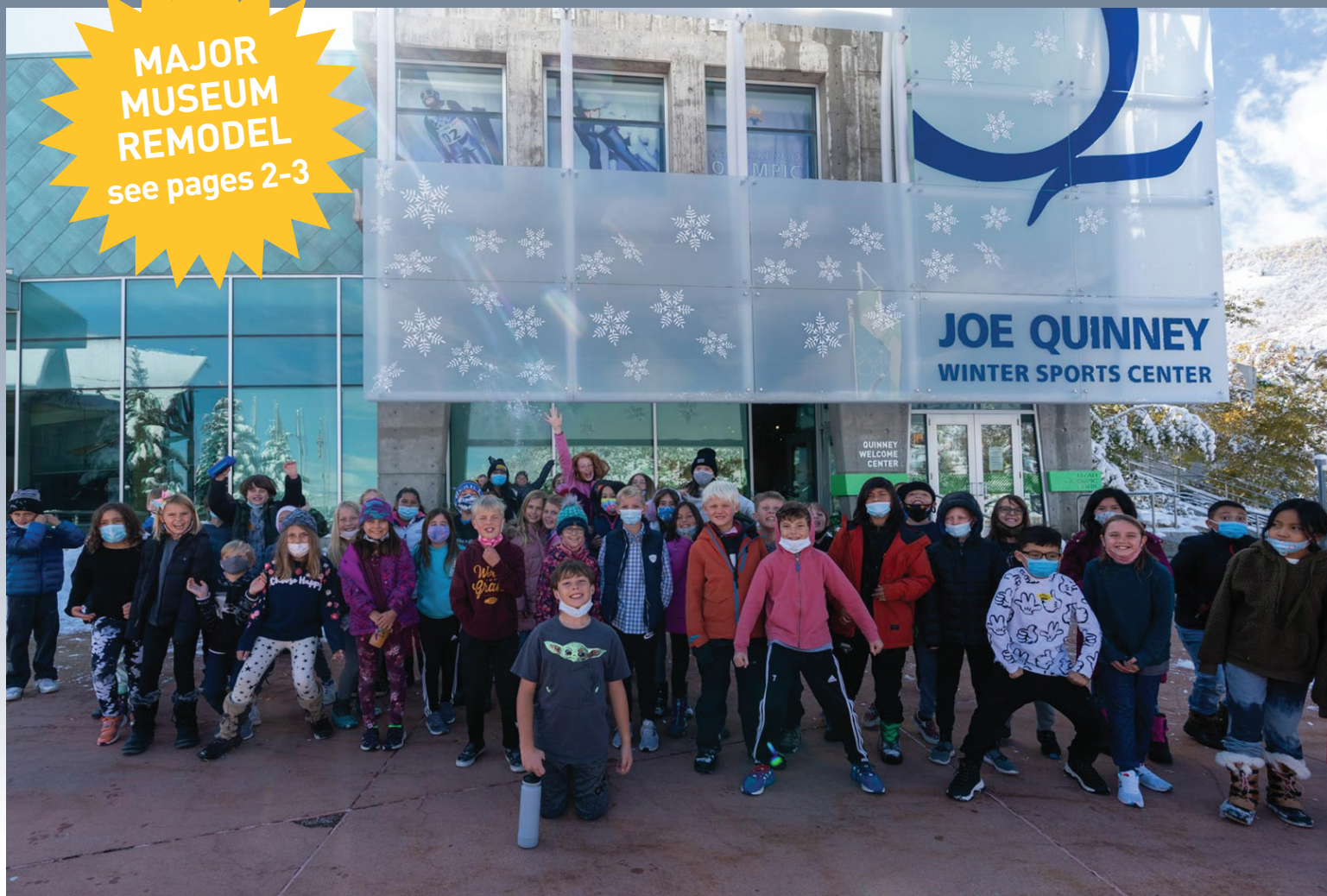
Fourth grade students from Trailside Elementary, Park City, tour the museums and the Utah Olympic Park.

Field trips return to the Alf Engen Ski Museum and the George S. and Dolores Doré Eccles 2002 Olympic Winter Games Museum