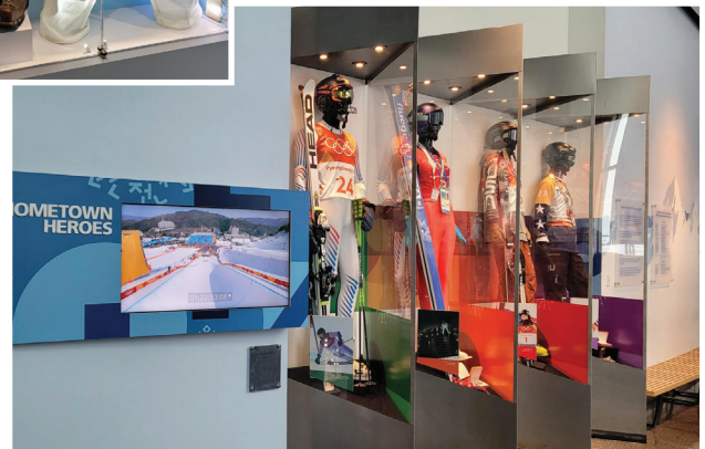
Olympic Winter Games Hometown Heroes Exhibit