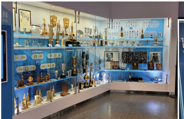
Alf Engen Ski Trophy Case