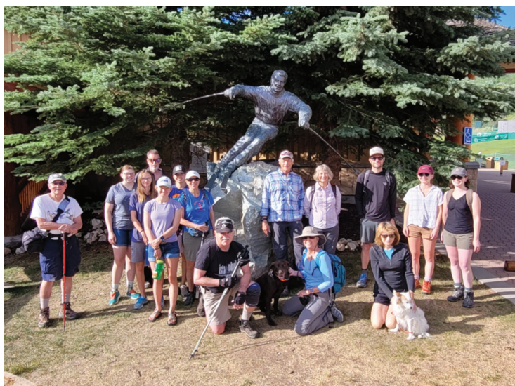
Hikers in front of the Stein Erikson statue, Deer Valley's Snow Park Lodge July, 2021