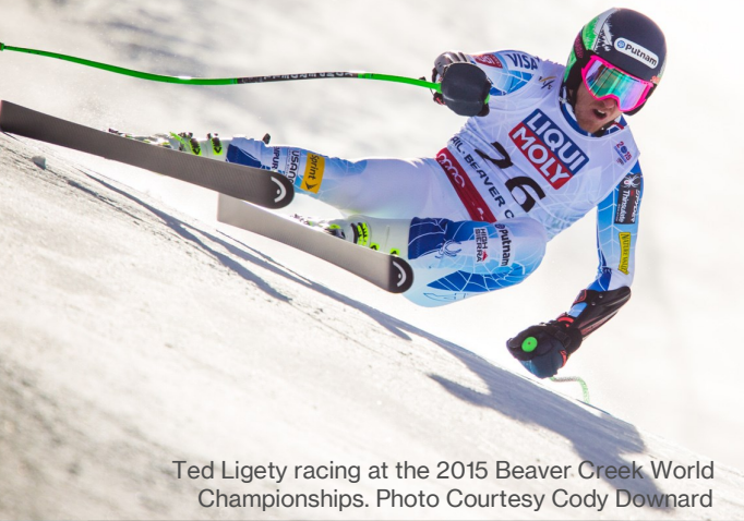
Ted Ligety racing at the 2015 Beaver Creek World Championships.