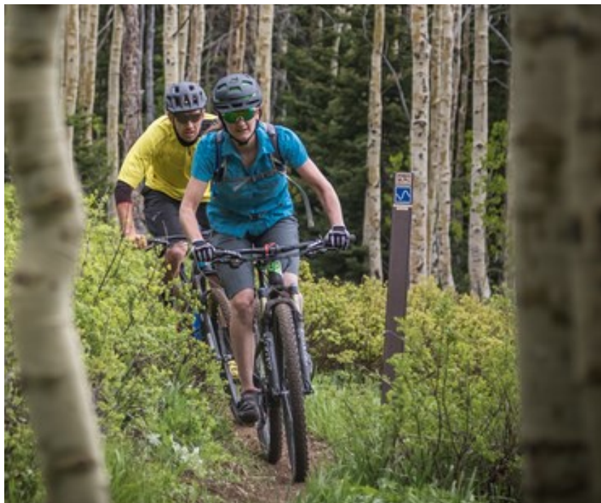
Mountain Biking at Deer Valley Resort

Check out skiutah.com for more activities, including a complete resort concert list.