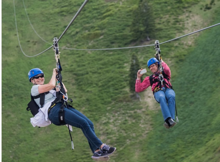
Ziplining at Sundance Resort

Did you know that Utah ski resorts are some of the Greatest places to visit during the summer? Utah's 15 resorts offer outdoor summertime experiences that (some might argue) top The Greatest Snow on Earth . There are so many options for different experiences. Here are just a few: