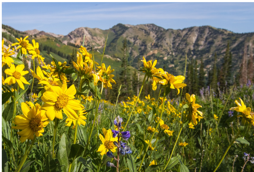
Wildflowers at Alta Ski Area