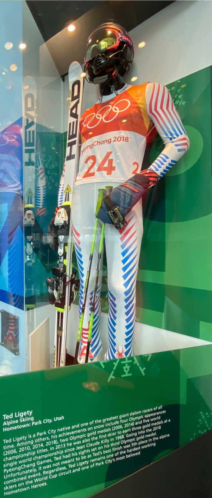
Ted Ligety Alpine Skiing Hometown: Park City, Utah Ted Ligety is a Park City native and one of the greatest giant slalom racers of all time. Among others, his achievements on snow include four Olympic appearances (2006, 2010, 2014, 2018), two Olympic gold medals (2006, 2014) and five world championship titles. In 2013 he was also the first skier to earn three gold medals at a single world championship since Jean Claude Killy in 1968. Going into the 2018 PyeongChang Games, Ted had his sights set on his third Olympic gold medal. Unfortunately, it was not meant to be as Ted's best finish was 5th place in the alpine combined event. Regardless, Ted Ligety remains one of the hardest working skiers on the World Cup circuit and one of Park City's most beloved Hometown Heroes.