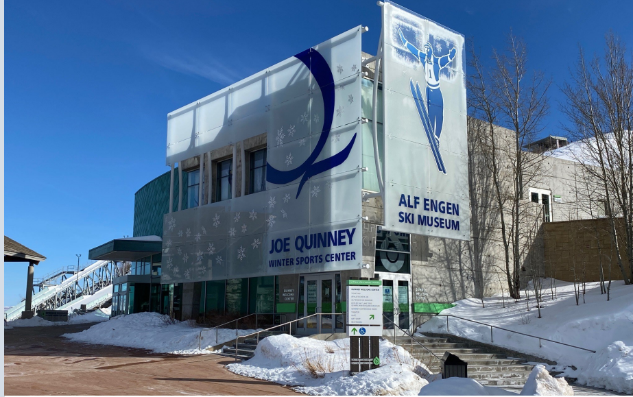
The Joe Quinney Winter Sports Center is home to both the Alf Engen Ski Museum and the Eccles 2002 Olympic Winter Games Museum