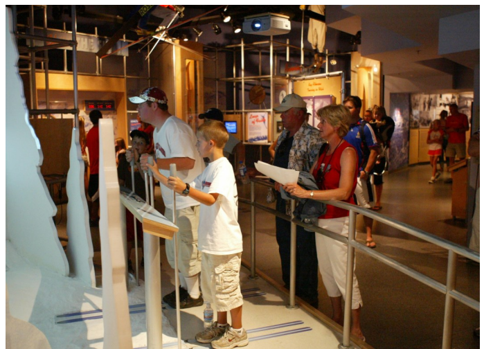
The original Ski Like an Olympian exhibit from 2002 on the north side of the Museum

The north side of the museum will be closed for construction from early September to the beginning of November 2021. A grand opening will be planned late 2021 or early 2022.