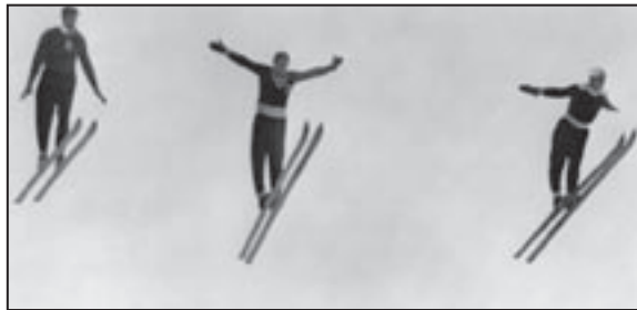
Three skiing legends performing a triple jump. (l-r) Casper Oimoen, Corey Engen, Alf Engen