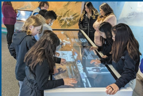
The interactive touch table exhibit with over 1,500 photos and videos is located on the first floor of the Alf Engen Ski Museum

Looking for the perfect place to spend a fun spring day? Be sure to check out these exhibits during your next visit to the Alf Engen Ski Museum!