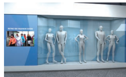
Concept plans for the proposed remodel of the museum's ski fashion exhibits and Intermountain Ski Hall of Fame Plans by Unrivaled