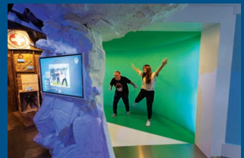
The photo booth is located on the first floor of the Alf Engen Ski Museum

Say cheese! Located just behind the interactive touch table is the museum's photo booth. Strike a pose with a bobsledder, jump in the ski jump pool, or even look out over the mountains. Our crowd-pleasing photo booth is always FREE and makes for a great memento.