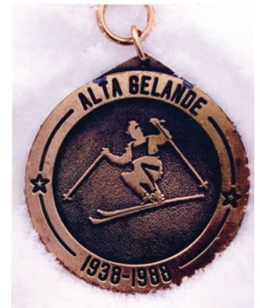
1989 Alta Gelande competition medal.