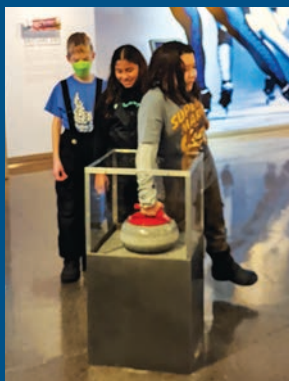
The Olympic Curling Stone weighs 44lbs and is located in the Eccles 2002 Olympic Winter Games Museum

Test your strength with an Olympic curling stone! Olympic curling stones weigh 44lbs and are mined from Ailsa Craig in Scotland. This fun interactive is located on the second floor of the S. J. (Joe) Quinney Winter Sports Center and in the Eccles 2002 Olympic Winter Games Museum.