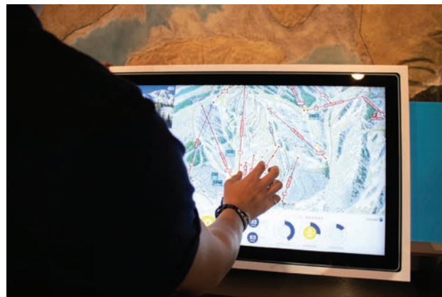
The new Topo Map Resort Profiles upgrade includes an interactive exploration of Utah’s ski resorts and projected map boundaries

Thank you to the donors who helped make the Topo Map possible!