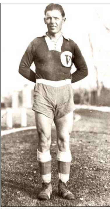
Soccer star, Alf Engen

Soccer in the 1930s was far different than it is today. Grass fields were a rarity; they were commonly dirt, cinders, or even blacktop. Alf and the Vikings played in heavy, ankle length boots imported from Europe that featured a hard toe with hobnails for traction. There were no substitutions; you played the entire 90 minutes, unless you got hurt. Injuries were common, and Alf was hurt on more than one occasion. Through it all, however, Alf displayed the same sportsmanship that made him one of the most beloved athletes in American sports history.