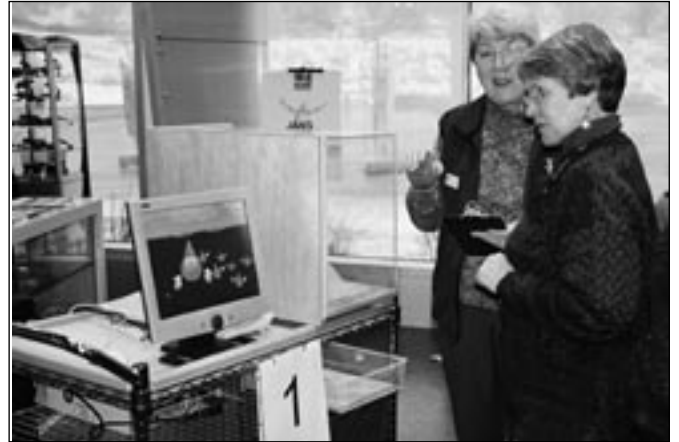
Lobby of Quinney Center - Education Program Carts