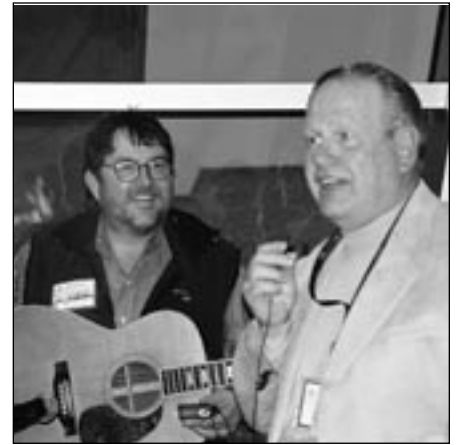
Cocktails and Reception - 3rd Floor Quinney Conference Room