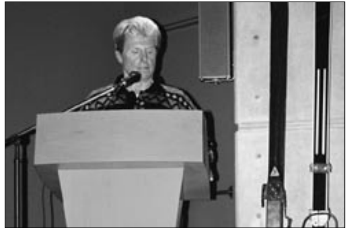
Stein Eriksen - Guest Speaker