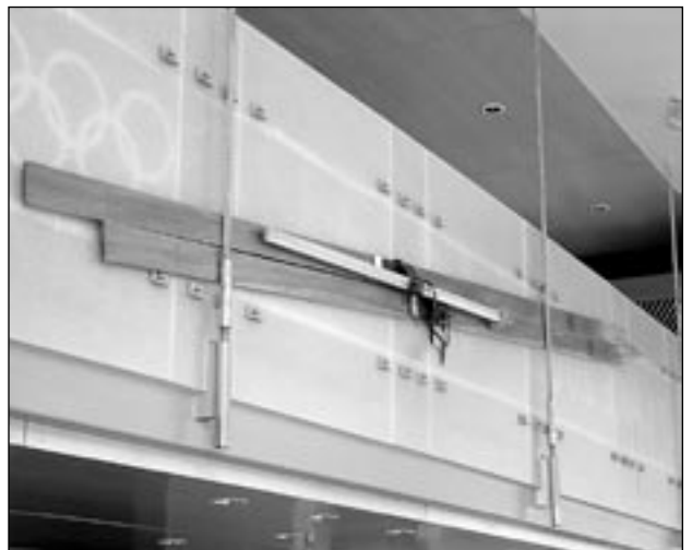
"Wasatch Lightning Longboards" skis displayed in the Quinney Center foyer