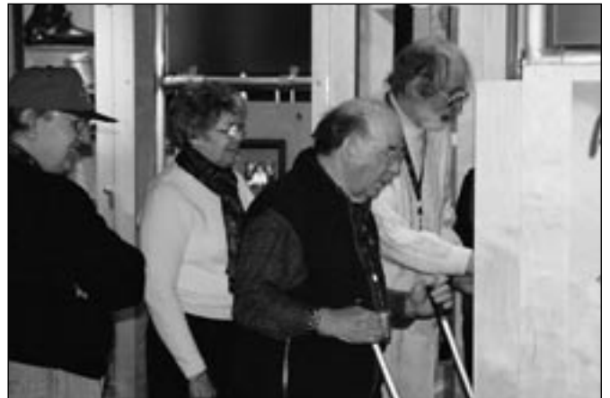
Alf Engen Ski Museum - Interactive Ski History of Utah