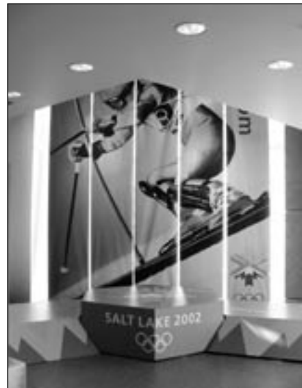
Official Medals Plaza Podium