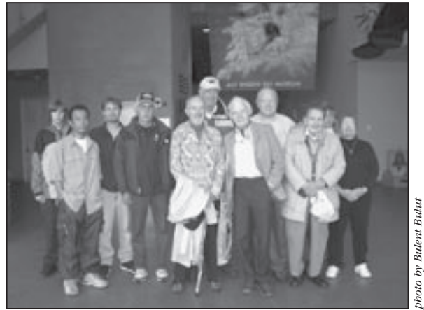
Utab Chapter of the Tenth Mountain Division Association