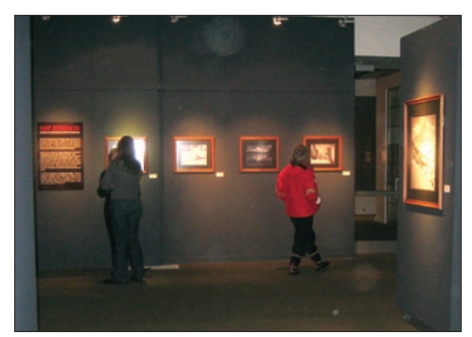
Great lighting - thanks Erin!