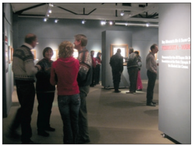
Gallery Reception - February 18, 2006