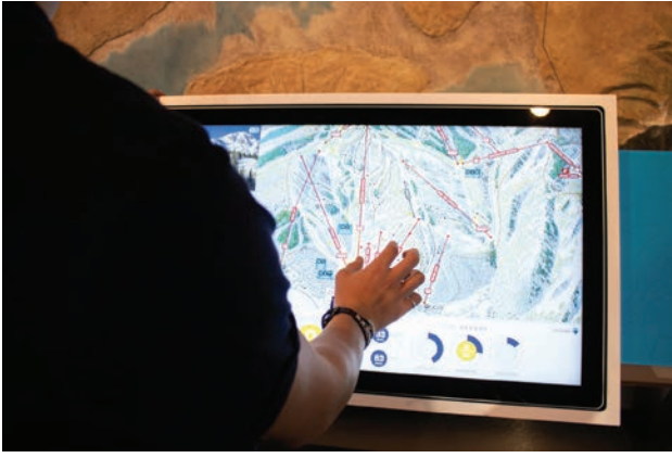
The new Topo Map Resort Profiles upgrade includes an interactive exploration of Utah's ski resorts and projected map boundaries

Thank you to the donors who helped make the Topo Map possible!