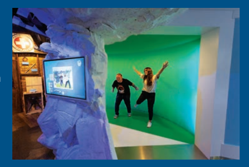
The photo booth is located on the first floor of the Alf Engen Ski Museum

Say cheese! Located just behind the interactive touch table is the museum's photo booth. Strike a pose with a bobsledder, jump in the ski jump pool, or even look out over the mountains. Our crowd-pleasing photo booth is always FREE and makes for a great memento.