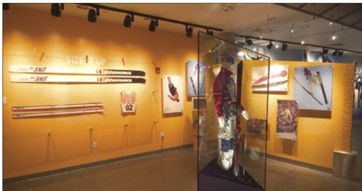
Ski jumping exhibit at the museum.