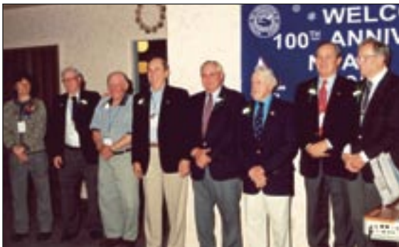
Past inductees of the U.S. National Ski Hall of Fame

The weekend saw special performances by local students who recreated the history of skiing by