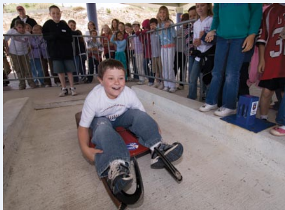
Trying out a luge sled