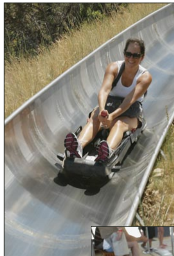
Quicksilver Alpine Slide