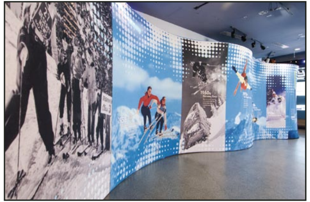
View of Museum Entry Wall looking toward entrance.

Lighting was improved to showcase the wall, an aluminum-frame structure with a printed fabric wrap that can be replaced and refreshed later with new content. The wall was designed by Jared Sweet and built by Utah's Fusion Graphics.