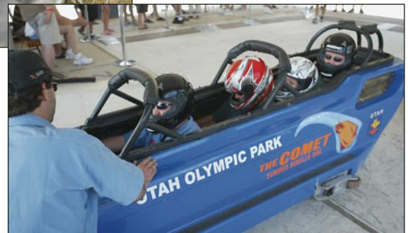
The Comet - wheeled bobsled