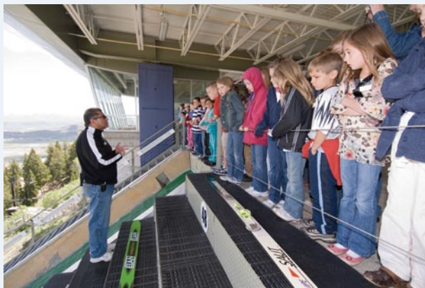
Tour of Utah Olympic Park