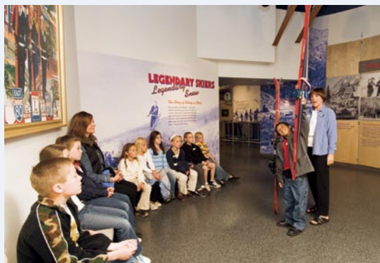
Hands on experiences