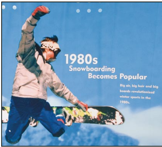
1980s detail of entry wall.

This new entry has been made possible thanks to the generous donations of our Museum members, the Office of Museum Services and the Marriner S. Eccles Foundation.